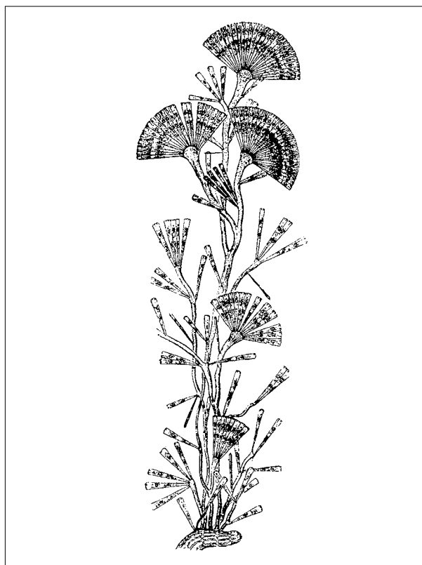
Bacillariophyta (Diatoms). After Mangin 1908.

ambiguity as to which was the case); none of these records included information on habitat and distribution and no reference was made to vouchers. Short of tracking down everything that could qualify as old literature and deducing from this which were new records, there is no way to verify the sources. With the lack of habitat and distributional information in that aforementioned major Gulf of Mexico summary, and our concern regarding possible overvaluation of reports from the Gulf of Mexico that should themselves require better documentation in years to come, we elected to not treat habitats and distributions to the same extent as in other chapters of this volume. Although a modern species nomenclator for the Bacillariophyta does exist, namely the Catalogue of the Fossil and Recent Genera and Species of Diatoms and their Synonyms (Van Landingham 1967, 1968, 1971, 1975, 1978a, 1978b, 1979), online sources such as Index Nominum Algarum (Silva 2006), AlgaeBase (Guiry and Guiry 2007), and the California Academy of Sciences Diatom Names (Fourtanier and Kociolek 2006) provide additional information on the diversity of this group. Therefore, these online sources are being used to confirm reported species as distinct.